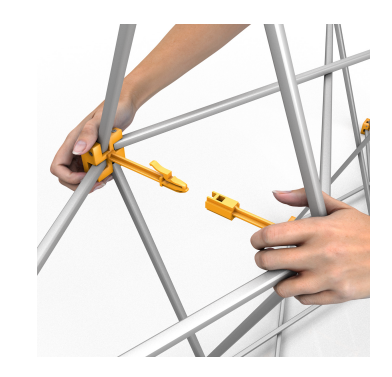
Push-Fit Tool-Free Assembly