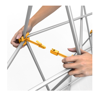
Push-Fit Tool-Free Assembly