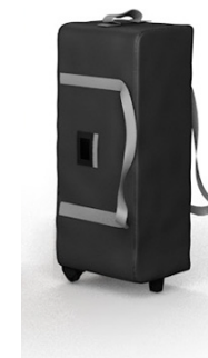
Carry Bag Included