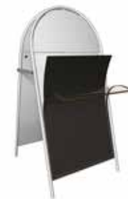
Magnetic A-Frame Pavement Sign