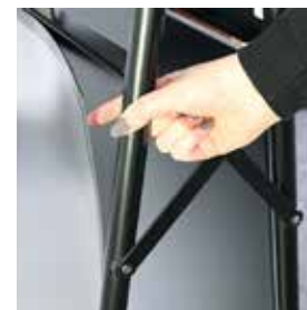
Includes Weatherproof Poster Covers