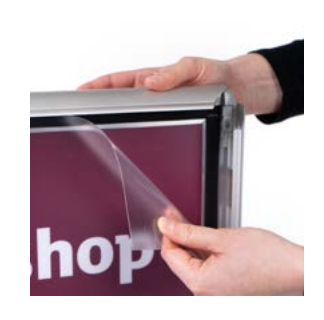
Aluminium Snap Poster Frame.