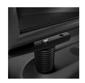
Metal Coiled Springs.