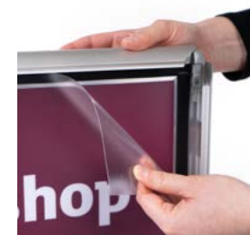
Aluminium Snap Poster Frame.