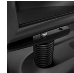
Metal Coiled Springs.