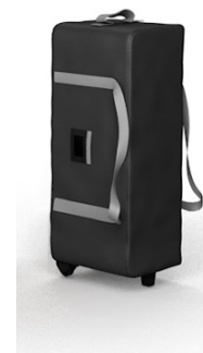
Carry Bag Included