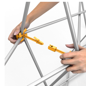
Push-Fit Tool-Free Assembly