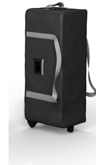
Carry Bag Included