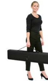
Carry Bag Included