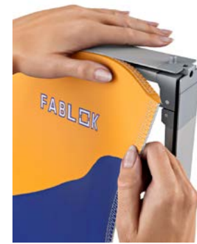
Custom printed silicone edge graphics