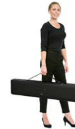
Carry Bag Included