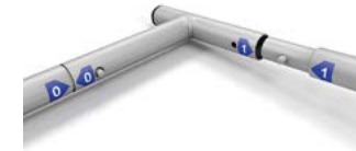
Numbered Push-Fit Tube Frame