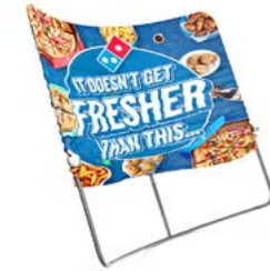
Aluminium Frame / Polyester Graphic