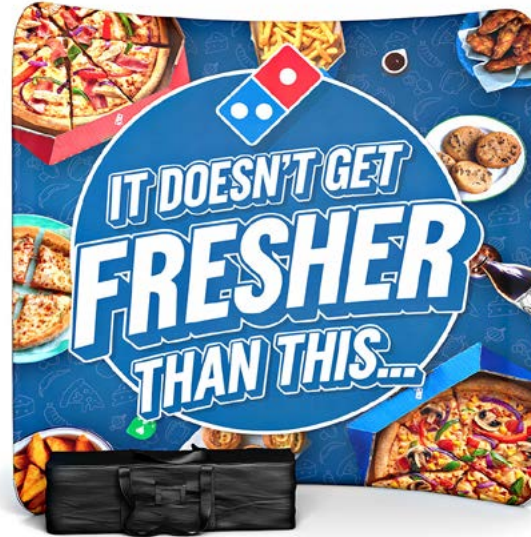
Carry Bag Included