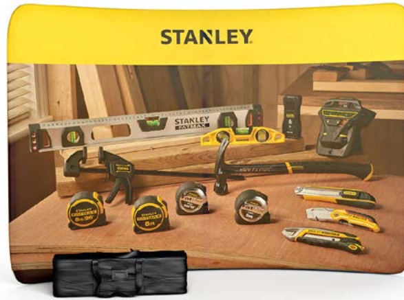
Carry Bag Included