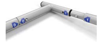
Numbered Push-Fit Tube Frame