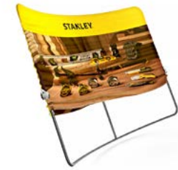
Aluminium Frame / Polyester Graphic