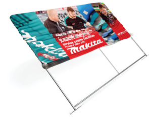
Aluminium Frame / Polyester Graphic