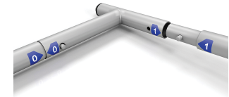
Numbered Push-Fit Tube Frame