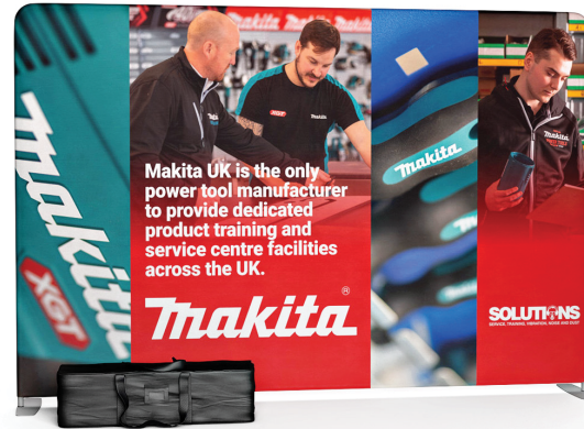
Carry Bag Included