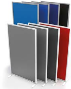
8 Fabric Colours Available