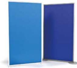
White or Silver Frame