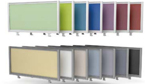
Opaque Privacy Screen in 13 Colours