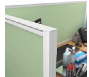
Linking Privacy Screens