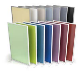
White Or Silver Frame

Barrier Screens For Patient Dignity & Privacy