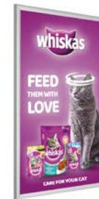
Even Illumination Guaranteed