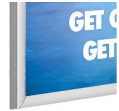
Stylish Low Profile Frame