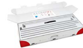
Includes Specially Designed Carry Box