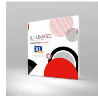
Double Sided Illuminated LED Lightbox