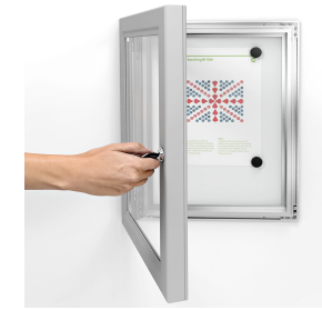
Lockable Poster Cases For Indoor & Outdoor Use