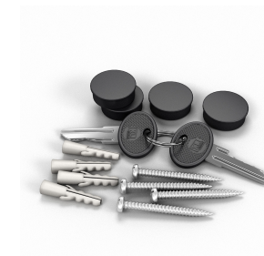
Free pack of pins, 2 keys & Wall Hanging Kit