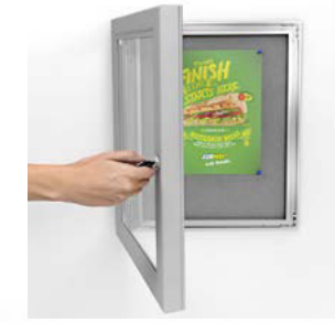
Lockable Poster Cases For Indoor & Outdoor Use