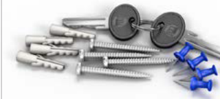
Free pack of pins, 2 keys & Wall Hanging Kit