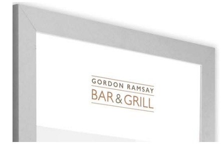
Optional Printed Logo Header Panel