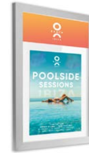
Weatherproof & Durable Design