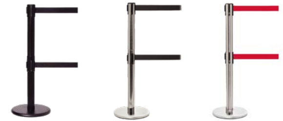
Choice of Three Colour Posts