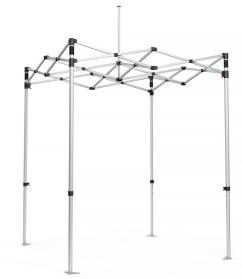
40mm Hex Aluminium Frame