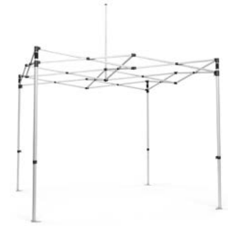
40mm Hex Aluminium Frame