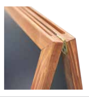
Made With Real Wood