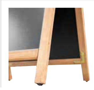
Non-Slip Feet & Leg Stays For Stability