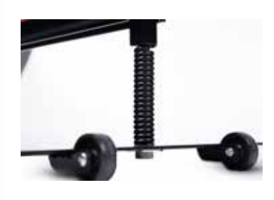
Metal Base Plate With Portable Wheels