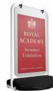
Poster Pocket OR Vinyl Graphic Panel