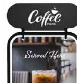
Optional Tactical Header Add-on