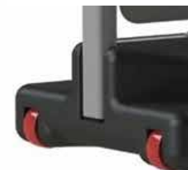
Integral Wheels For Easy Transportation