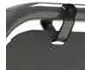
Double Sided Swinging Pavement Sign