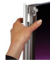
Snap Open Poster Frame