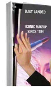
Quick & Easy Poster Changes