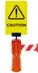
Roadside Warning Barrier