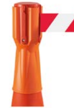
Fits Most Standard Traffic Cones