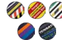
Full range of colours, designs and custom options