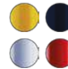
Four plastic finishes available