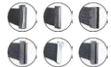
Six tape end options available