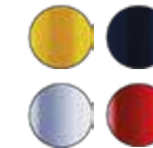
Four plastic finishes available