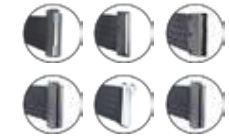
Six tape end options available