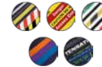
Range of colours, designs and custom options