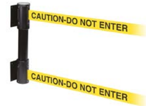
Seven Pre-Printed Safety Messages