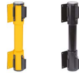
Black & Yellow Barrier Finishes