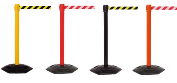
Choice of Four Colour Posts