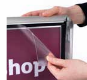
Aluminium Snap Poster Frame.