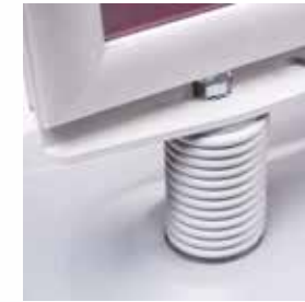
Metal Coiled Springs.