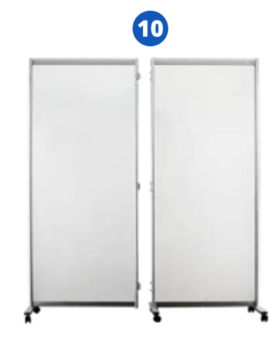
10. With two people, lift screens and align together