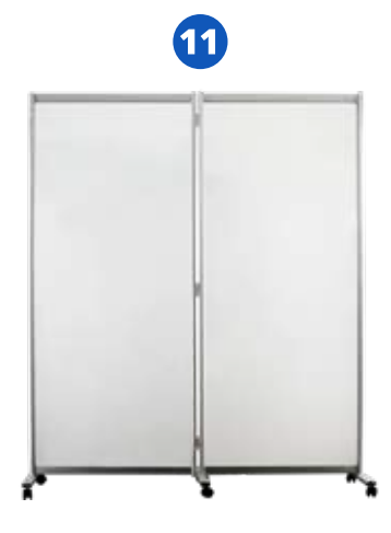
11. Carefully interlock the hinges and use pins to secure. Ensure pins are fully locked in place