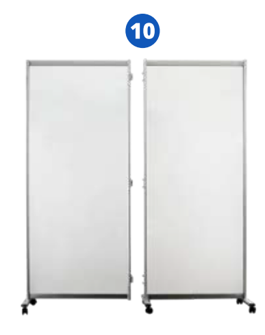
10. With two people, lift screens and align together