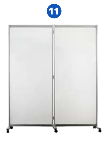
11. Carefully interlock the hinges and use pins to secure. Ensure pins are fully locked in place