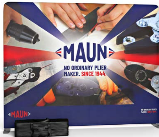
Carry Bag Included