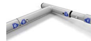
Numbered Push-Fit Tube Frame