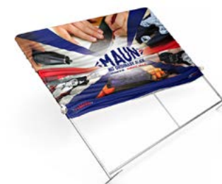
Aluminium Frame / Polyester Graphic