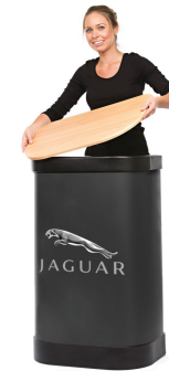
Case To Counter Conversion