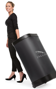
Wheeled Transport Case