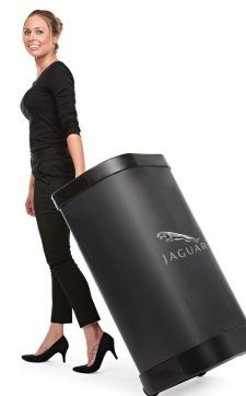
Wheeled Transport Case