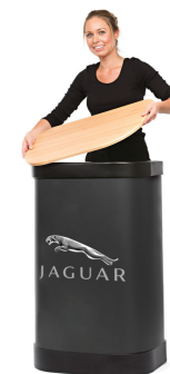
Case To Counter Conversion